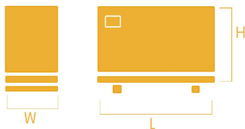
Over All Size